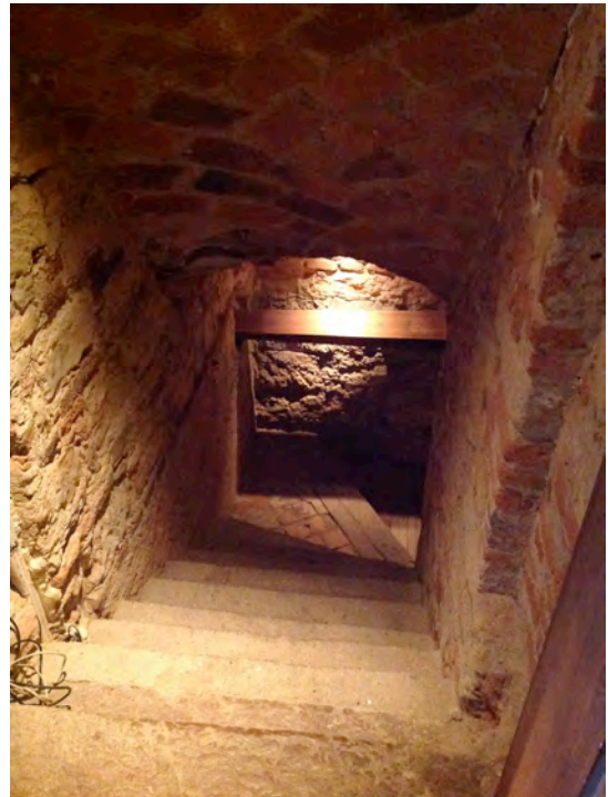
Steps down to venue

The walls are hung with paintings that cannot be removed for shows.